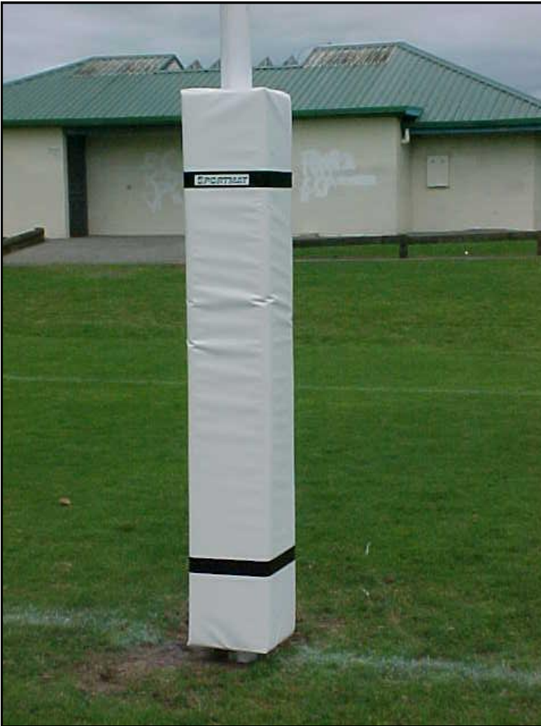
Standard Colour is blue

The Sportmat Rugby Goal Post Pads are manufactured from prime quality foam which ensures consistency and durability. The design is 2 metres high and four sided which ensures that even if the pad rotates on the post, there is still 100 mm thick protection for the players.