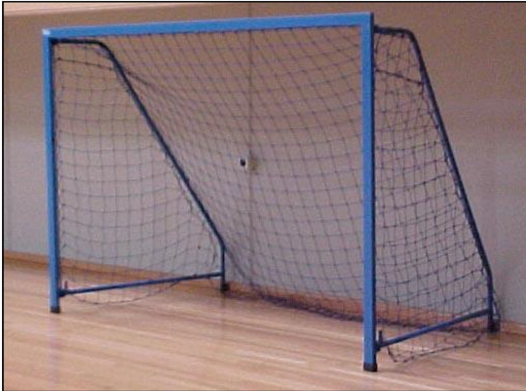
Shown in different powder coat colour